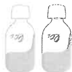
Two bottles of CLENPIQ (5.4 oz each)